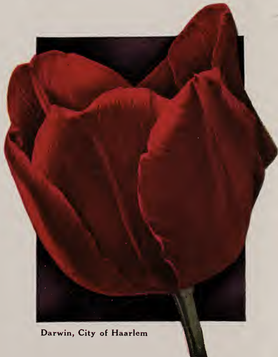
Darwin, City of Haarlem

Come to our store, if possible, and see these new Floralite Plates. They will assist you in making selections.